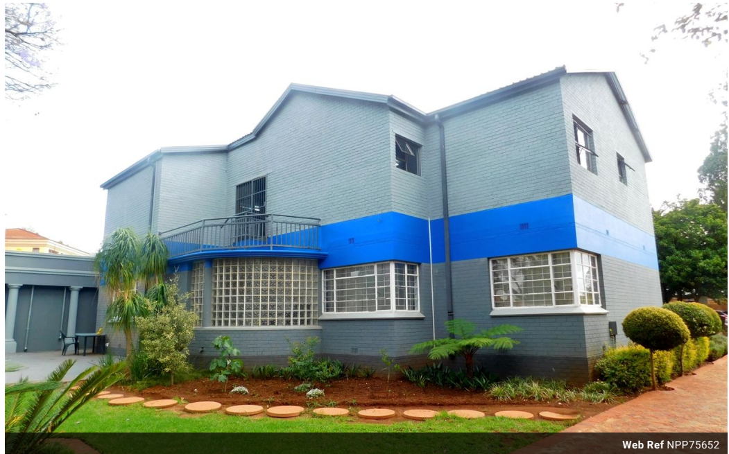
Web Ref NPP75652