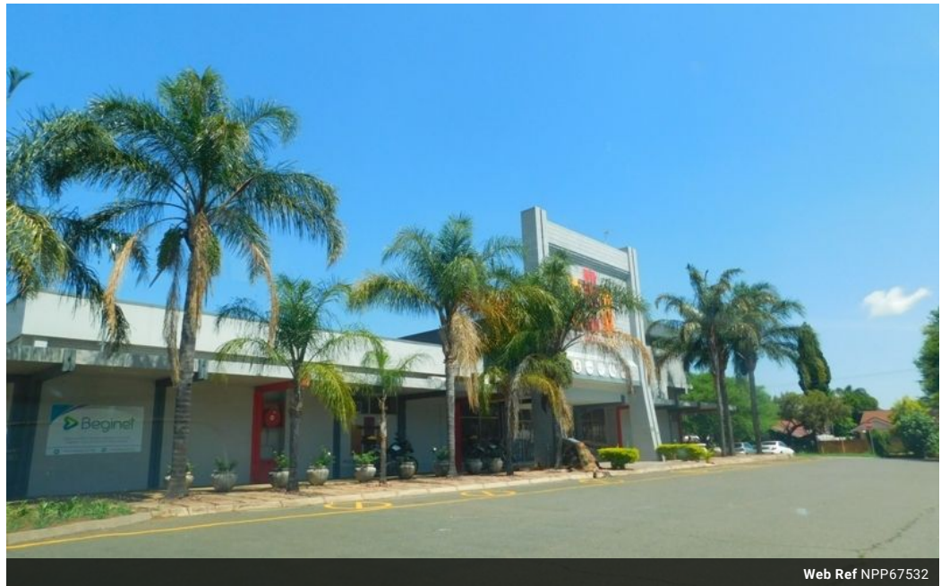
Web Ref NPP67532