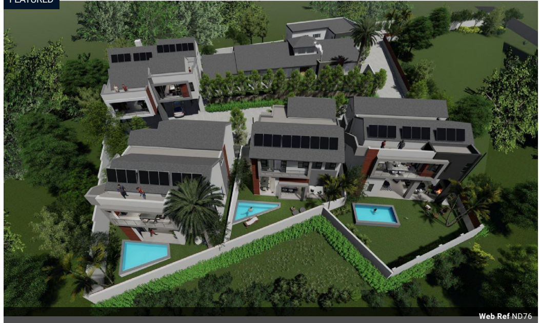
Web Ref ND76