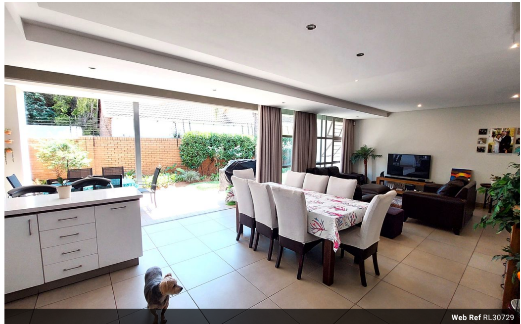
Web Ref RL30729