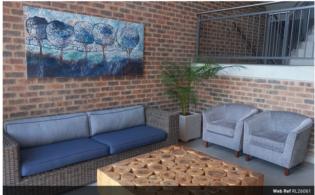
Web Ref RL26061