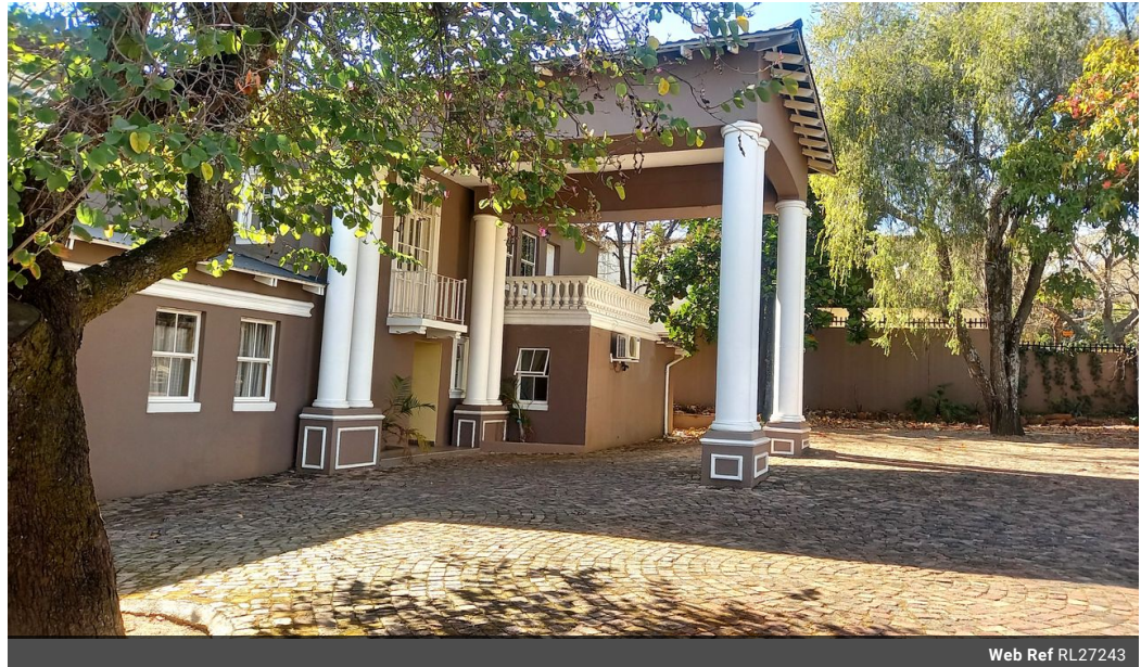
Web Ref RL27243