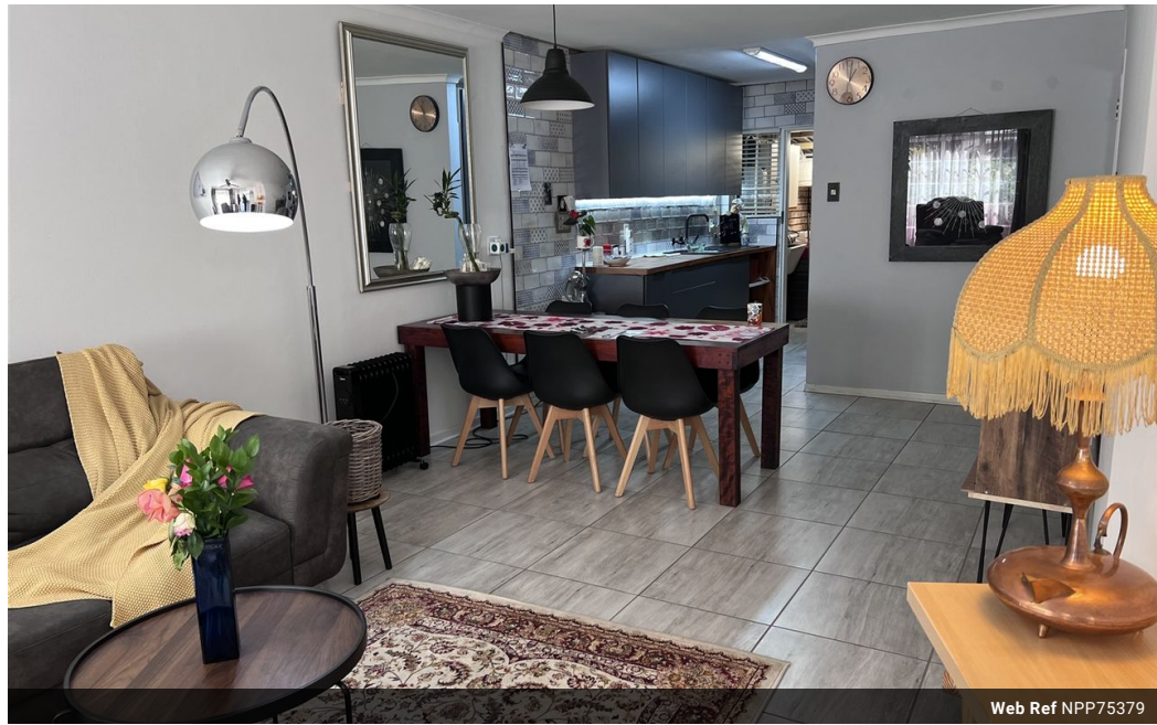
Web Ref NPP75379