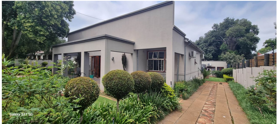
Galaxy S21 5G