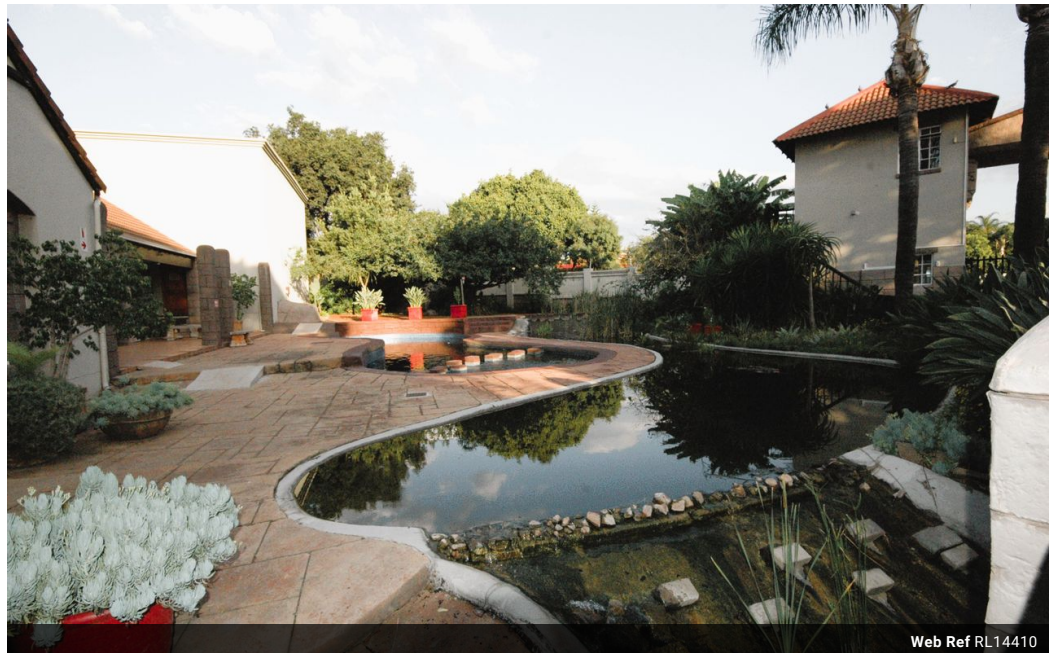
Web Ref RL14410