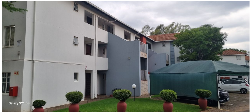
Galaxy S21 5G