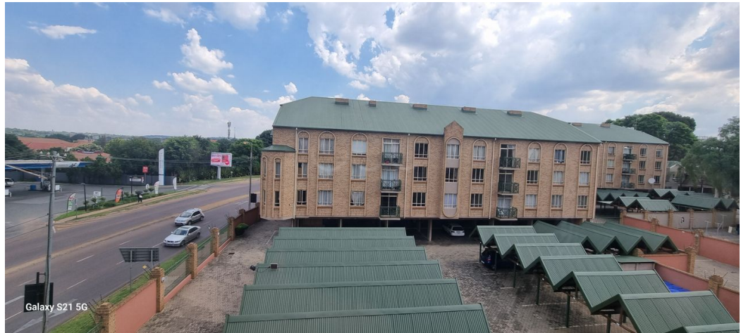
Galaxy S21 5G