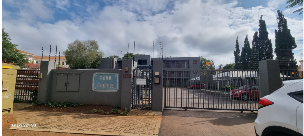
Galaxy S21 5G