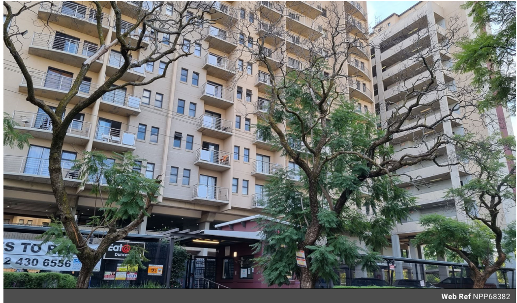
Web Ref NPP68382