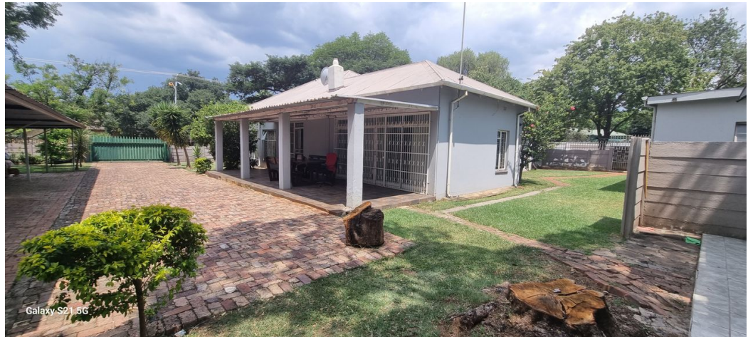
Galaxy S21 5G