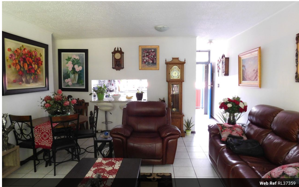
Web Ref RL37359