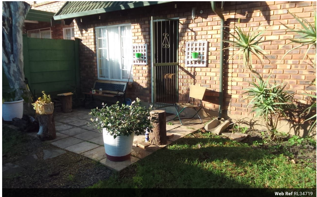
Web Ref RL34719