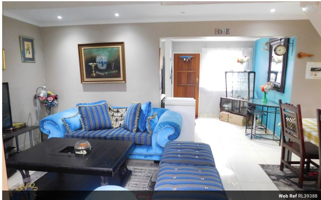
Web Ref RL39388