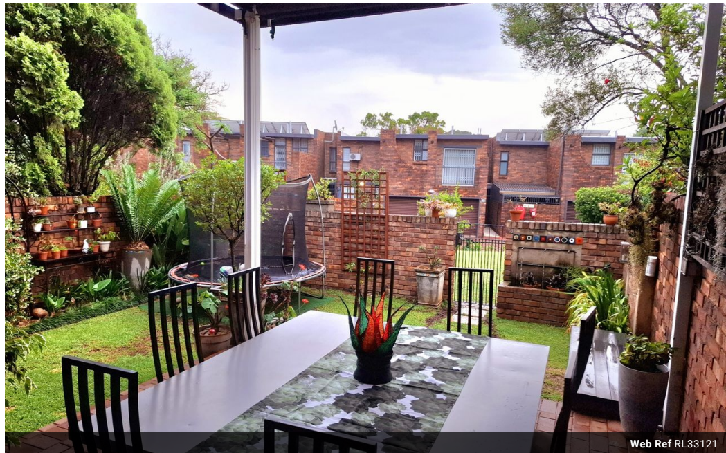
Web Ref RL33121