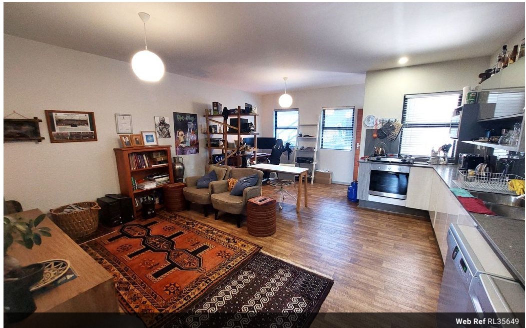
Web Ref RL35649