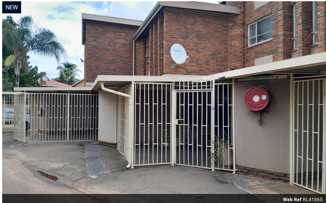
Web Ref RL41065