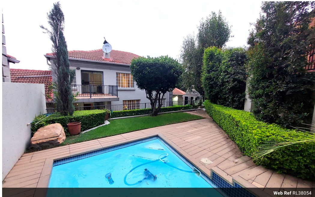
Web Ref RL38054