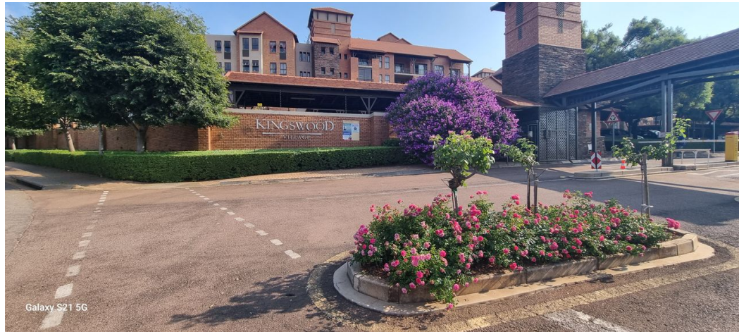
Galaxy S21 5G