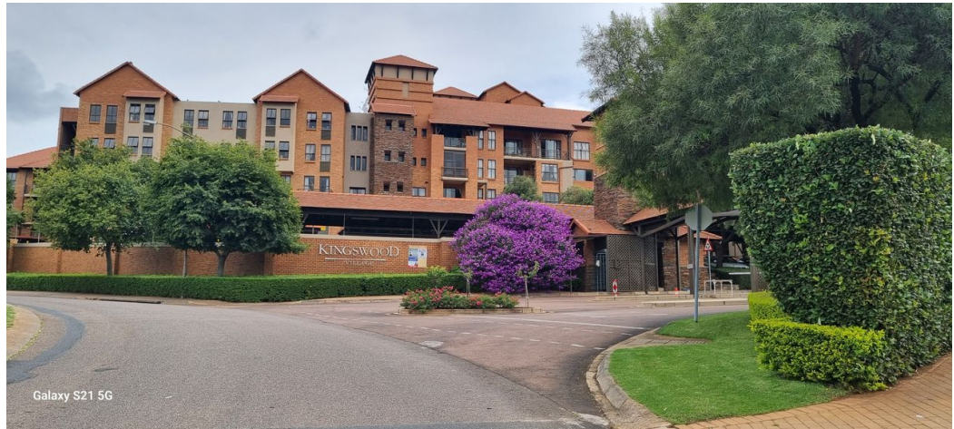
Galaxy S21 5G