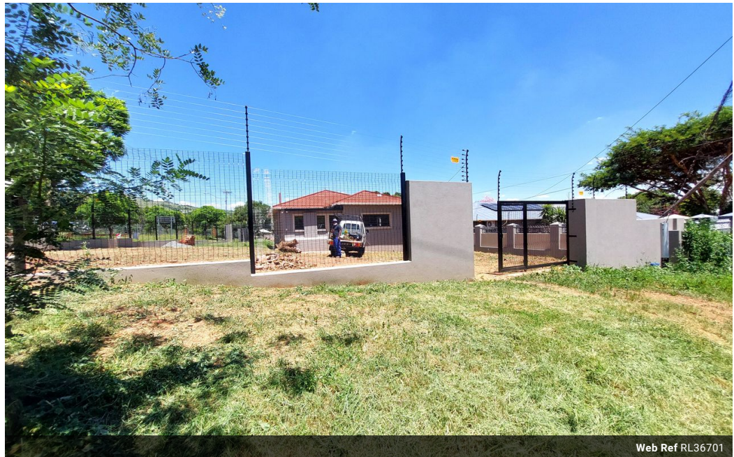
Web Ref RL36701