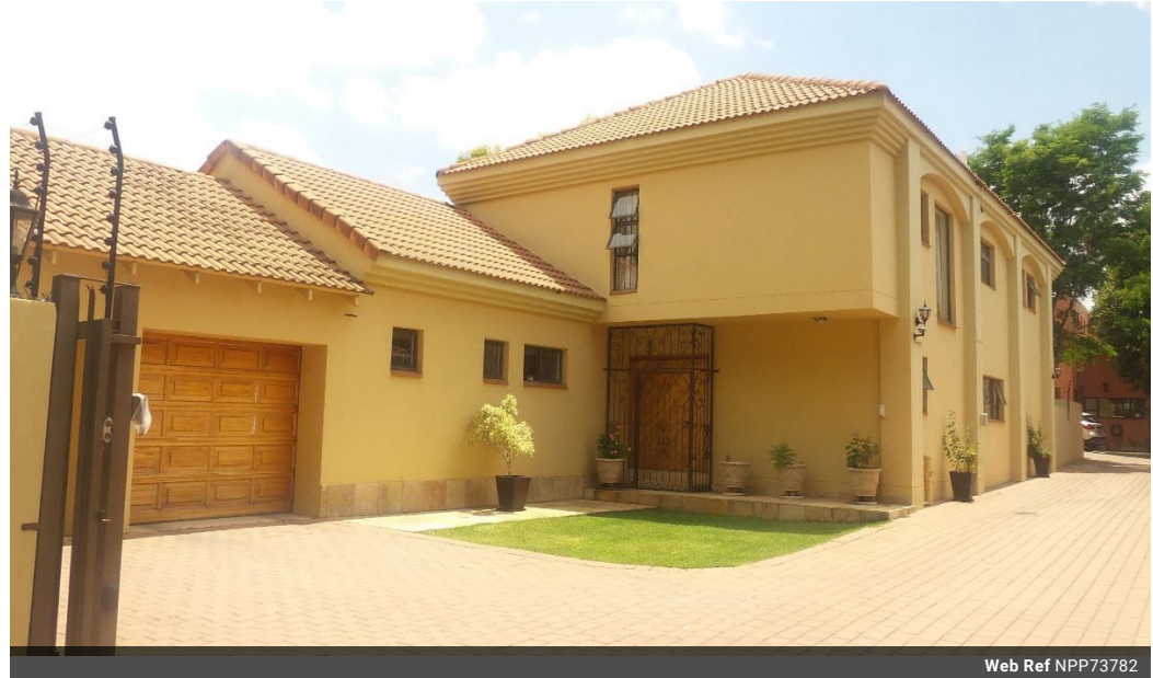
Web Ref NPP73782