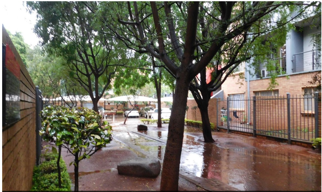
BANK ASSISTED, SOLE MANDATE