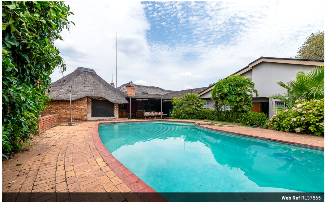
Web Ref RL37565