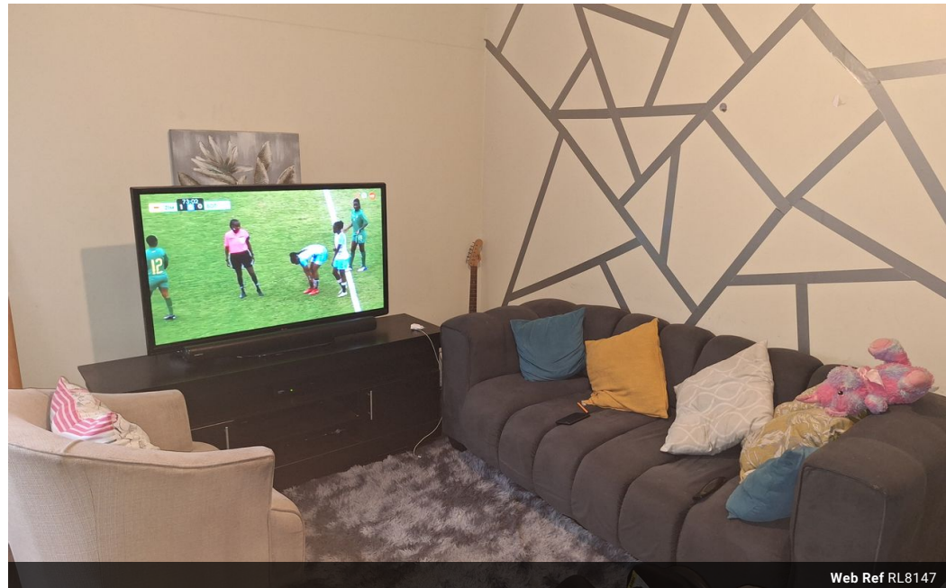
Web Ref RL8147