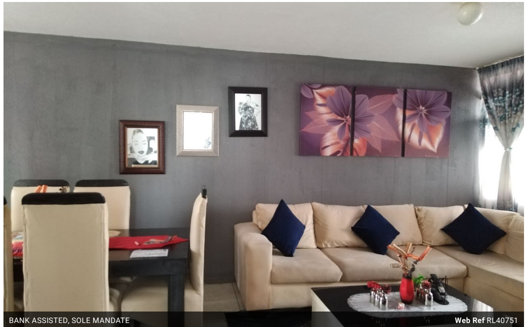
BANK ASSISTED, SOLE MANDATE