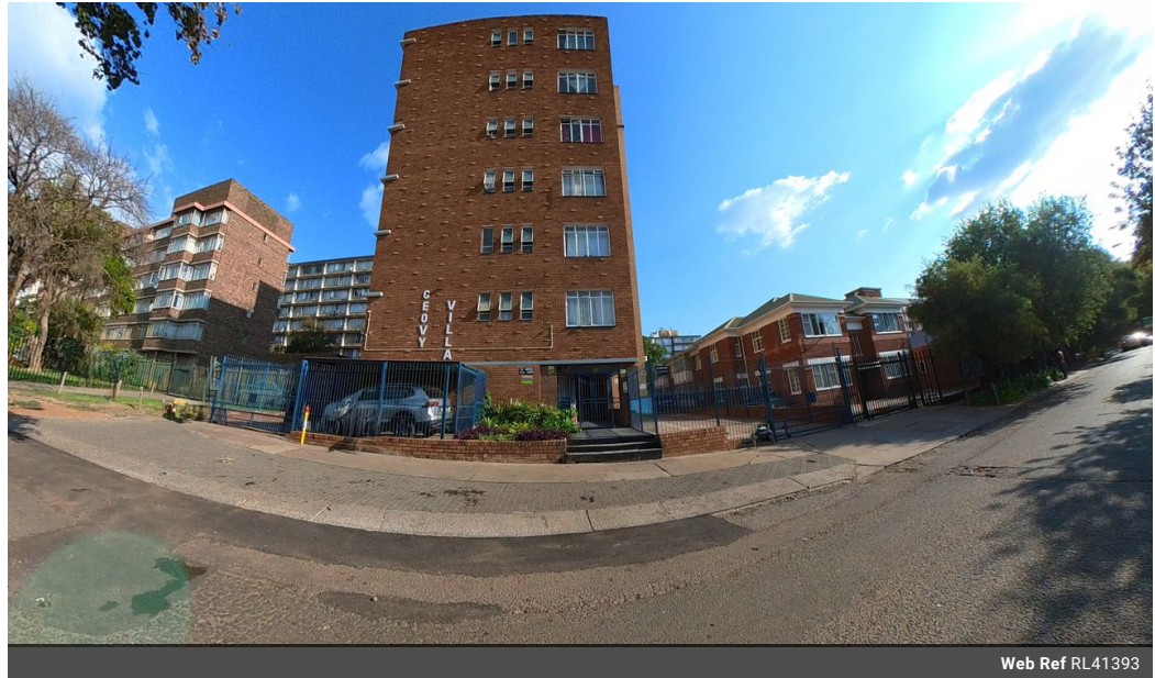
Web Ref RL41393