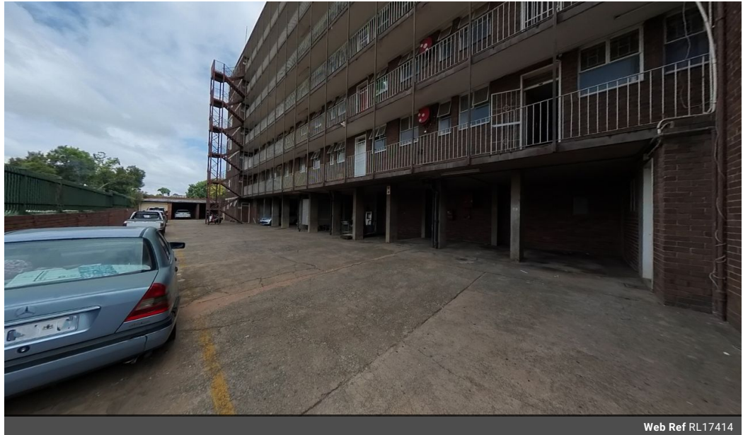
Web Ref RL17414