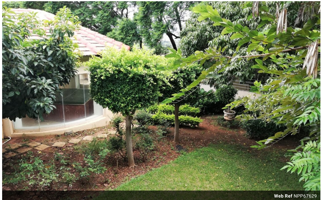
Web Ref NPP67629