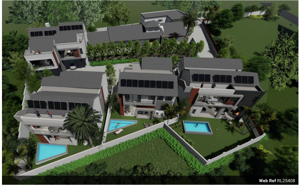
Web Ref RL25408