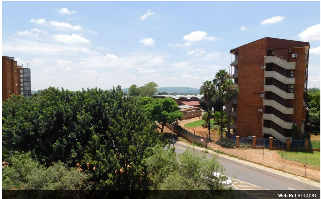
Web Ref RL14081